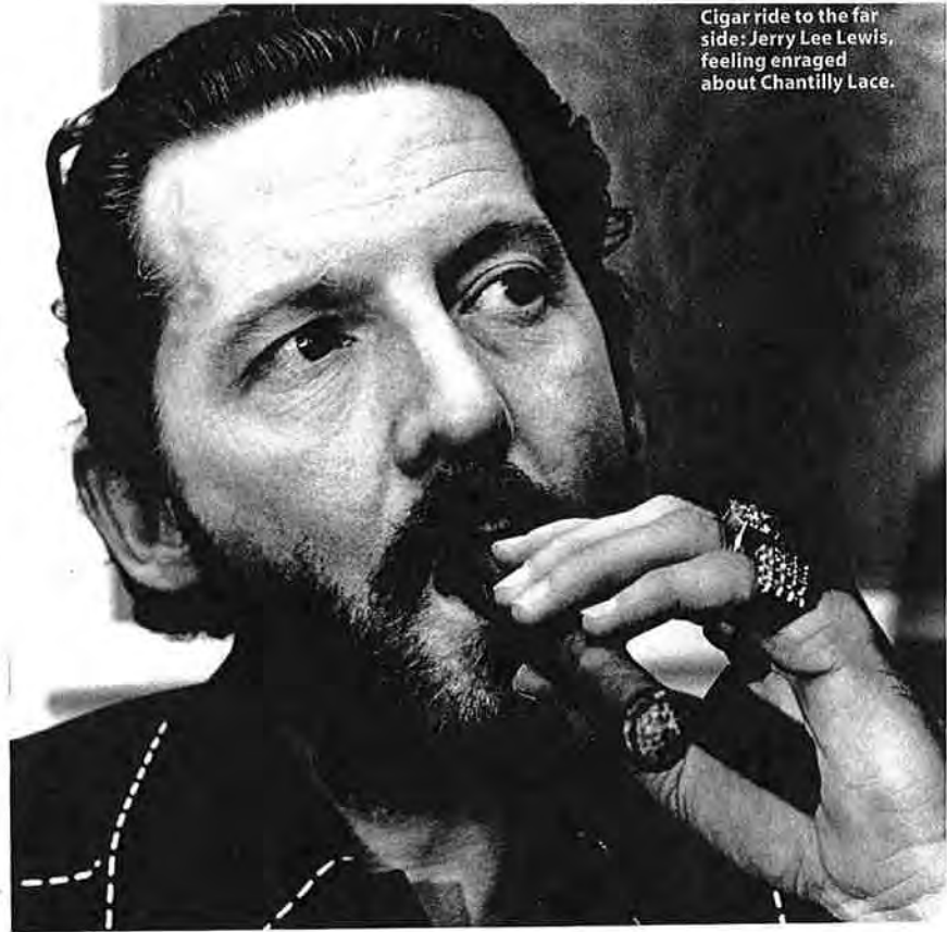
Cigar ride to the far side: Jerry Lee Lewis, feeling enraged about Chantilly Lace.