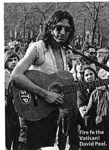
Fire fe the Vatican! David Peel.

Isn't that Cooky of the Pistols modelling this covetable long-line "plushy" suede